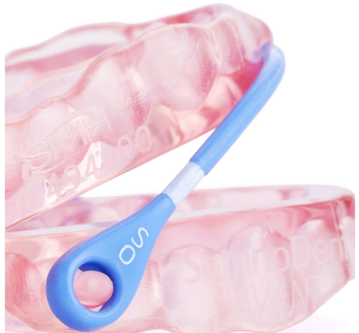
Somnomed Oral Appliance Up Close

To refer a patient for the management of sleep-related breathing disorders, please complete an online referral or download a referral form . A sleep study and referral are generally required for a consultation, especially for patients to claim health insurance.